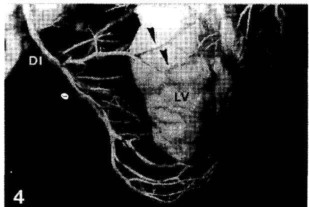
Fig. 4 – Internal cast of the left ventricle and coronary arteries of Eliomys quercinus . Vessels (arrowheads) originating from the dorsal interventricular branch (DI) penetrate the ventricular septum.

The most important contribution to the vascularization of the ventricular septum through penetrating vessels is due to the dorsal interventricular branch. At different levels of its course towards the apex of the heart, this vessel gives off a variable number of branches which penetrate more or less deeply into the septum (Fig. 4). Sometimes, the distal segment of the dorsal interventricular branch gradually enters the septum, reaching its middle part, and sends out short penetrating vessels. Dorsal parietal branches of the right coronary artery can also slightly penetrate the septum. Moreover, penetrating vessels often arise from the circumflex, dorsal ventricular, and ventral interventricular branches of the left coronary artery.