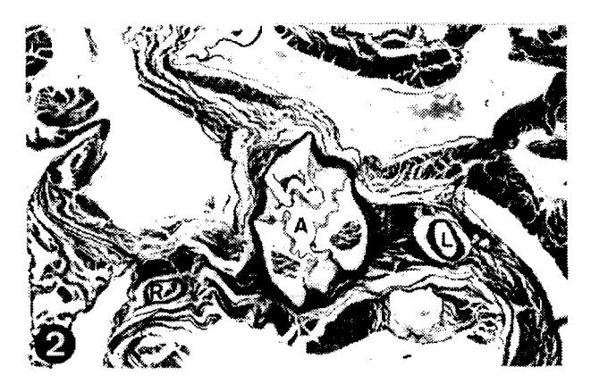
Fig. 2 – Transverse section of the heart of Eliomys quercinus at the level of the aortic valve (A). Note that the right (R) and left (L) coronary arteries show an intramyocardial course. x16, Mallory's trichrome.

trunk and then becomes intramyocardial (Fig. 2). Before reaching the obtuse margin of the heart, the main trunk sends an atrial branch which supplies the left atrium as well as a portion of the atrial septum.